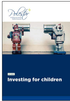
Investing for Children