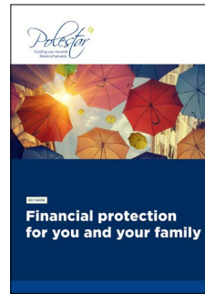
Financial protection for you and your family