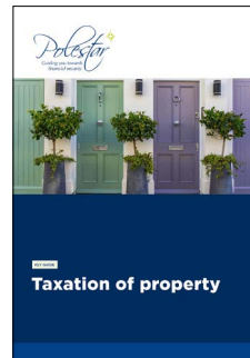
Taxation of property