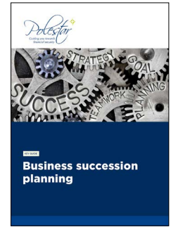
Business succession planning