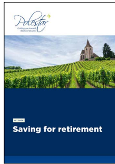
Saving for retirement