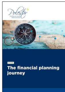
The financial planning journey