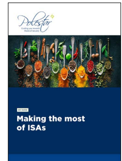
Making the most of ISAs

Call us now for further information or advice 01793 881602 or email Office@PolestarFP.com