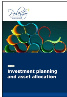
Investment planning and asset allocation