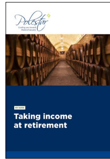
Taking income at retirement